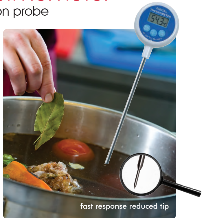
fast response reduced tip